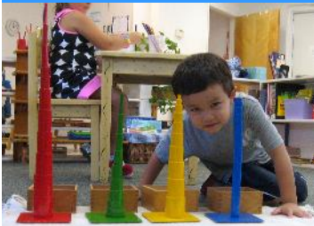
Ty is working with the knobless cylinders